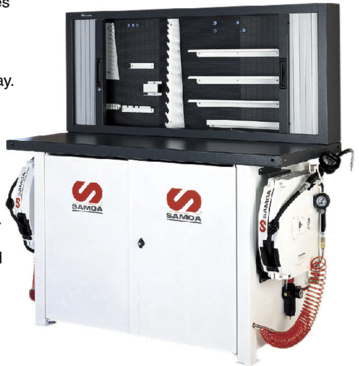
*Tool board optional